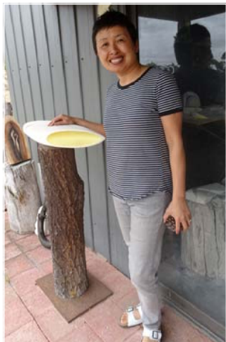
A bird bath created from local timber