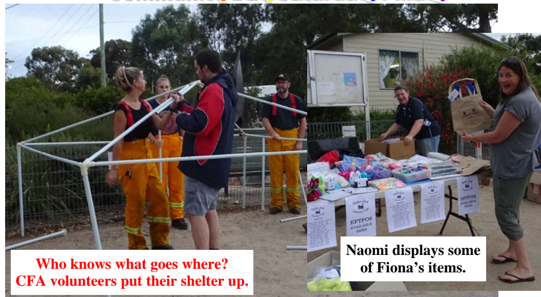
Who knows what goes where? CFA volunteers put their shelter up.